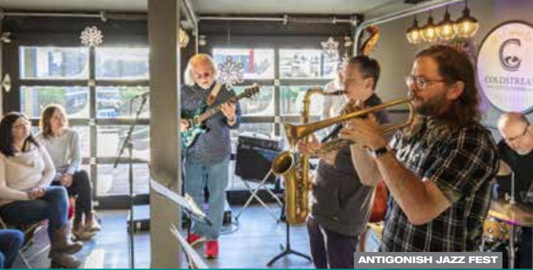
ANTIGONISH JAZZ FEST