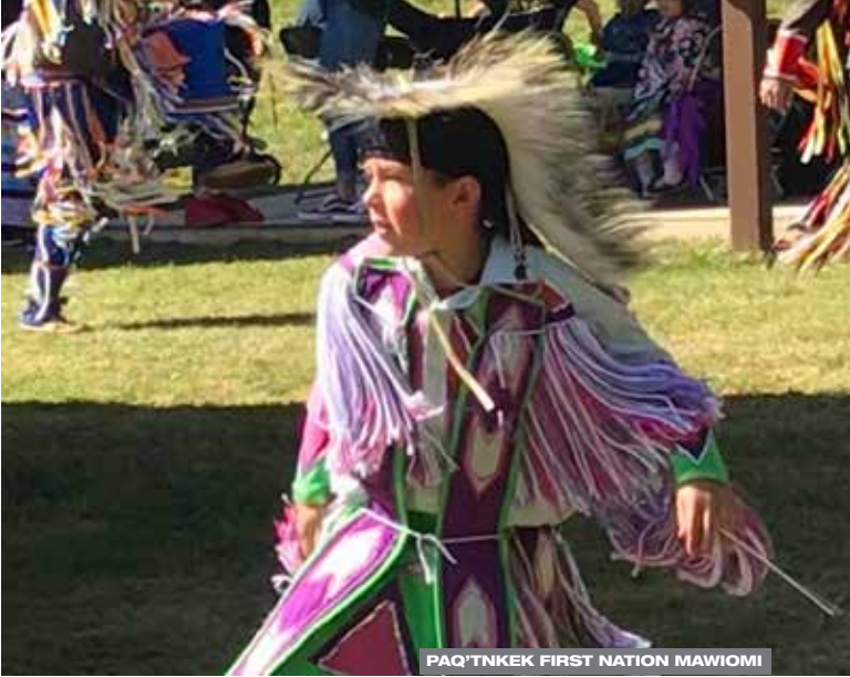
PAQ'TNKEK FIRST NATION MAWIOMI