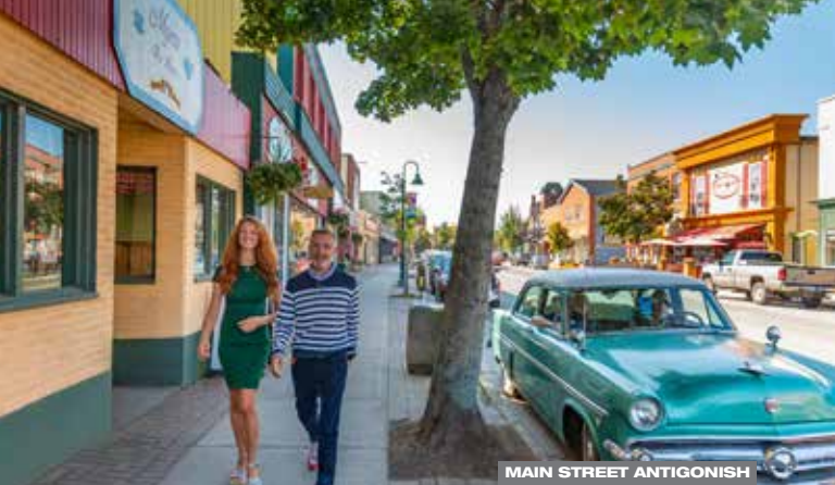
MAIN STREET ANTIGONISH