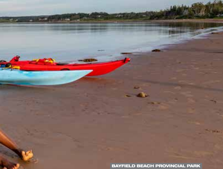
BAYFIELD BEACH PROVINCIAL PARK

your heart. Once you finish the blissful drive and it is adventure you are now seeking, head to The Keppoch and enjoy the multi-use trail system for year-round fun. If local fare is what you're after, there are many options for you to try. Whether it's taking in the view at Arisaig while enjoying a lobster roll, a casual drink on a patio, a seafood spread, or if fine dining is more your scene, Antigonish has it all.