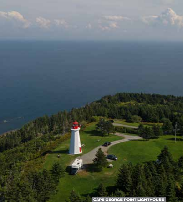
CAPE GEORGE POINT LIGHTHOUSE